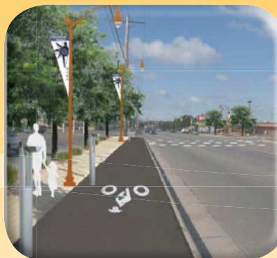
Bike lanes and sidewalks create safer transportation options

The plan calls for bikeways, sidewalks and new infrastructure that will create a safe, walkable corridor. These improvements will remake Cleveland Avenue into an attractive destination for shopping and will spur new investment.