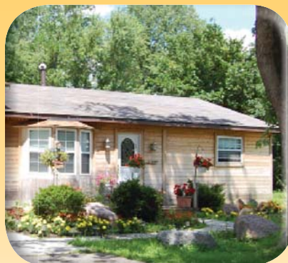
Homes in Leonard Park will be able to connect to the water system in the future