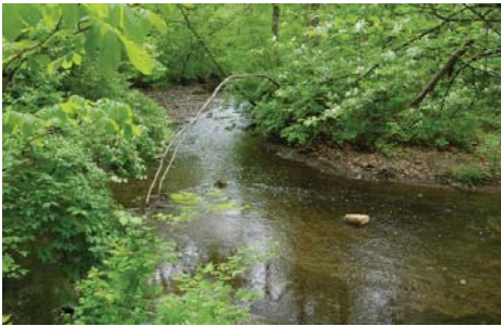
Clean Streams Northeast will protect Alum Creek for future generations

After gathering public input, we intend to present revised regulations to the Franklin County Commissioners later this year.