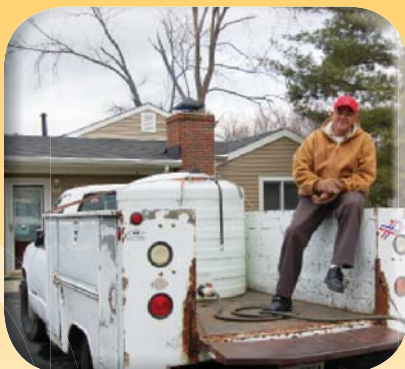
With the installation of water lines, residents will no longer have to truck in fresh water

Now that Columbus has agreed to allow access to water, Franklin County can begin the process of procuring funding to extend the water lines.