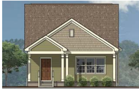
New homes under construction will fit with the character of the neighborhood

Our department worked with contractors to create home designs for Clinton and Mifflin Townships that fit with the current neighborhoods.