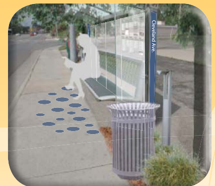
New bus stops will make using transit more enjoyable