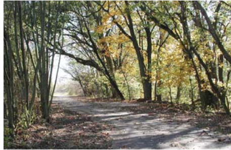
Multi-use trails provide recreational space for communities

19 mile multi-use trail to use for biking, walking or running. Construction should be completed in 2012.