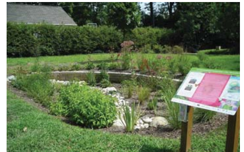
Rain gardens help stop pollution from entering our waterways

These spaces will also function as education centers to inform the public about the environmental benefits of rain gardens. Construction should be complete in Spring of 2011.