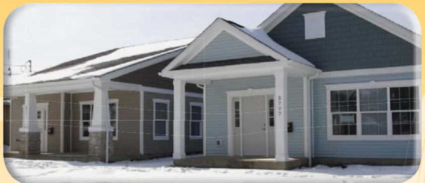
New homes under construction will boost property values and become affordable, attractive additions to neighborhoods

These new homes follow AWARE standards and use designs that complement other homes in the neighborhood. Construction of the homes should be completed in March 2011.