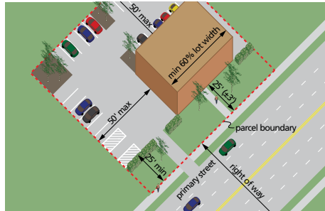
The Smart Growth Overlay will create more attractive, walkable communities

Streetscape improvements are a proven way of stimulating private sector investment along a corridor. A safer, more attractive Cleveland Avenue will become an asset and a symbol of the community.