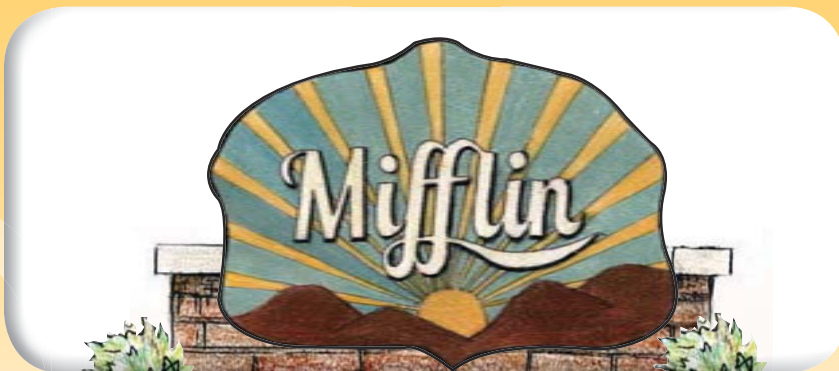
Gateway signs, like this example, will identify the Township and foster community pride

Signs will be placed at key entrances, creating attractive gateways to the community. The signage will foster pride among township residents.