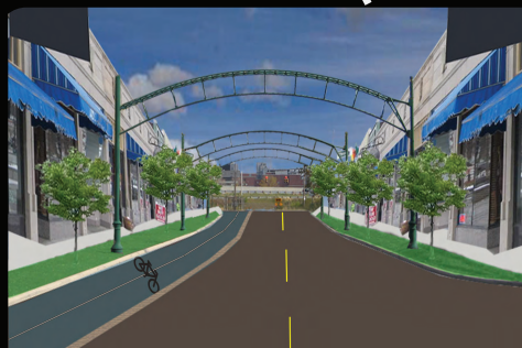
Proposed Retail Along Gateway