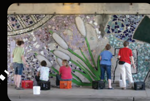
Murals under 315 Bridge