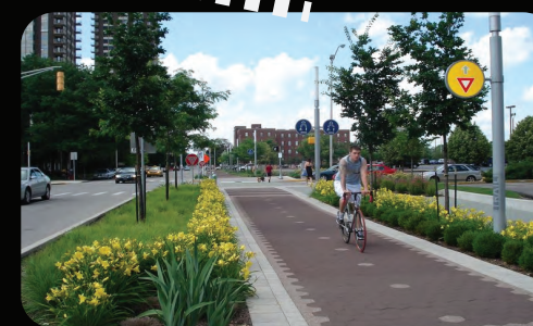
Two-Way Bike Lane on Olentangy