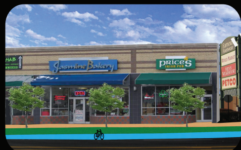
Proposed Retail on Olentangy