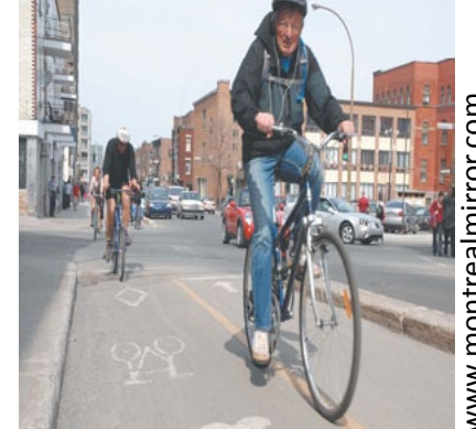
Figure 9- Montreal