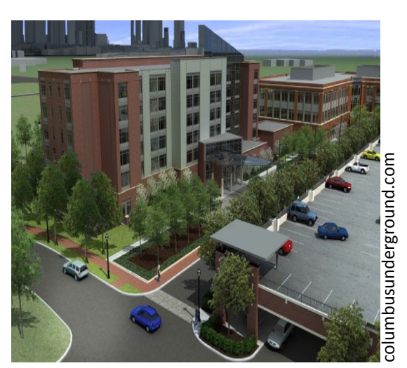
Figure 6- Grandview Yards

To truly make the parking garage on Site A accessible to the rest of Lennox Town Center a pathway will be needed from the parking garage cutting east through existing retail buildings. The location with the least amount of impact would be through the Beauty First Salon. This path will only include a sidewalk since there not sufficient space for a road here.