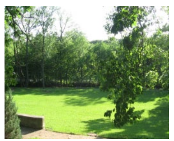
Figure 5- Parklike Setting