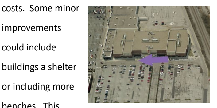
Figure 12- New Bus Stop Location

improvements could include buildings a shelter or including more benches. This would make the