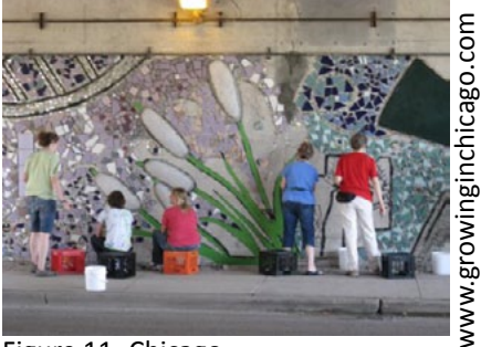
Figure 11- Chicago