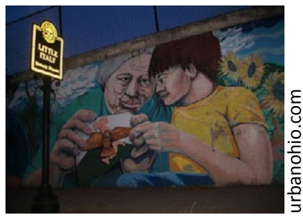
Figure 10- Cleveland

lighting should be added and the walls can be converted into paintings and murals. This is a technique used by cities across the country to brighter dark and dank underpasses. To create the murals at lower costs it would be a good idea to enlist neighborhood volunteers and Ohio State students.