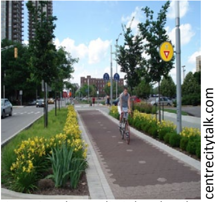
Figure 8- Indianapolis Cultural Trails

pass. Fortunately when the road is narrowed vehicular traffic will automatically slow down. Also creating a complete street on Olentangy River Road which is welcoming to pedestrians and other non-automobile modes of transportation could help spur more development on the corridor. While there is currently a strip mall with four tenants including a Starbucks across the street from The Lennox Town Center there are two vacant parcels to the North and South which could be developed. This area will however need a continuous sidewalk along the east side of the street. Making Olentangy River Road a complete street could also lead to the redevelopment of the underutilized Parcel on the Northwest corner of Olentangy and King Avenues into a more attractive retail or restaurant use.