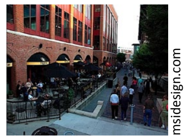
Figure 4- Nighttime Distirct